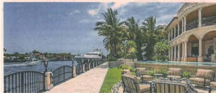
Number 5 Harborage Isle Drive, Harbor Beach, $32m

Could the uptick in overseas interest in Fort Lauderdale inject pace at the top of the market? Maybe, says Caldwell. "There's a lot of money here and people want to invest, knowing it's becoming more international."