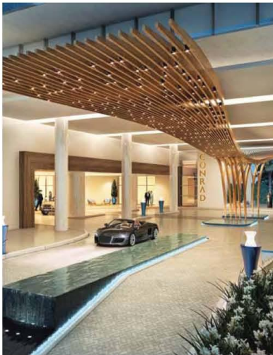
BEACH READY The Conrad Fort Lauderdale Beach Residences will house 290 units.

Waves will be lapping at your feet at the Conrad Fort Lauderdale Beach Residences, thanks to the condominium-hotel's oceanfront perch. Plus, units are newly built and just months away from occupancy.